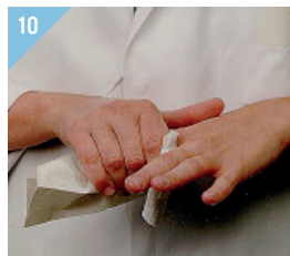
10 Dry the fingers, nails and in-between fingers