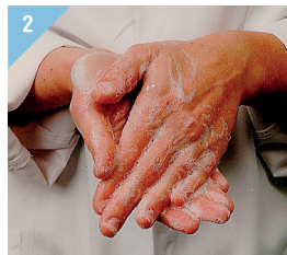
2 Apply the hand was and work up a lather