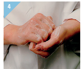
4 Cup fingers and lather back and forth