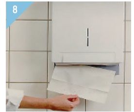
8 Dry hands with a single use paper towel