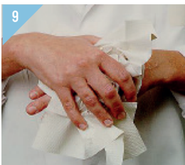
9 Dry front and backs of hands