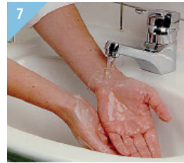
7 Wash off lather away from the body