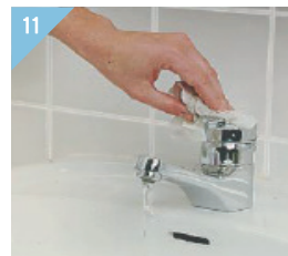
11 Use paper towel to turn off tap