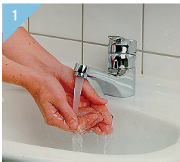
1 In the hand wash basin, wet hands

Stop Germs Spreading • Always Wash Your Hands