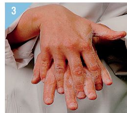
3 Interlace fingers and rub lather in-between