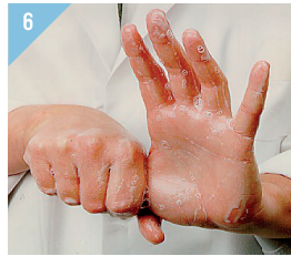
6 Rotate the lather over each thumb