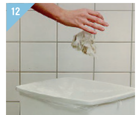
12 Dispose of towel appropriately